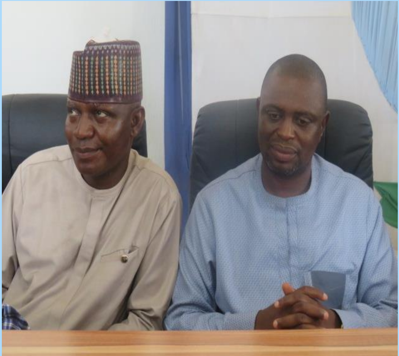
THE DIRECTOR INTERNATIONAL COOPERATION(LEFT) AND DIRECTOR BUDGET