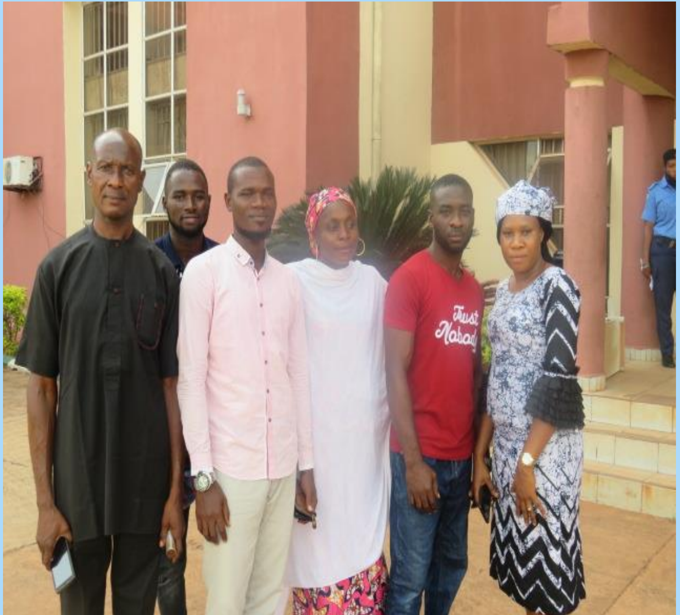
STAFF OF MIN. OF FINANCE, BUDGET AND ECONOMIC DEVELOPMENT