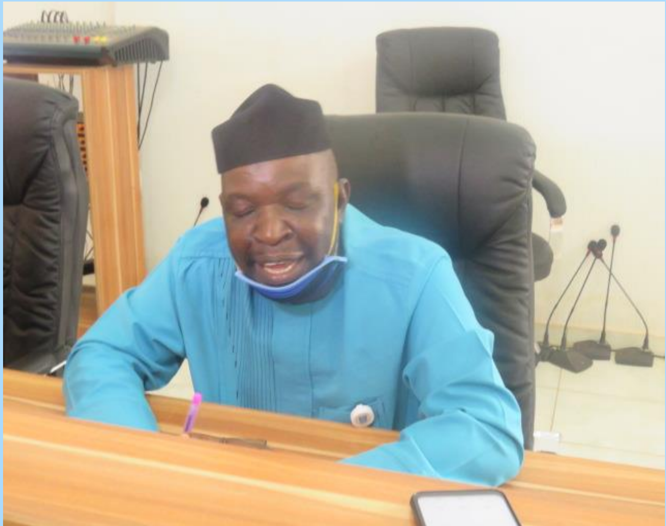
DVC KOGI STATE UNIVERSITY, ANYIGBA